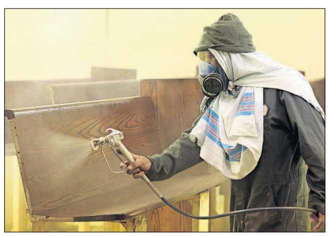
A church pew is refinished inside The Keck Group building in Middletown.