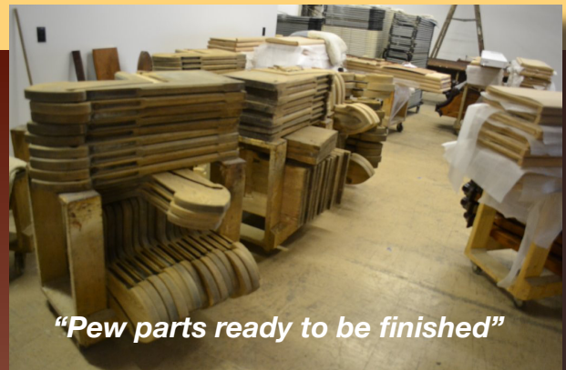
"Pew parts ready to be finished"

Instead of opting for the expensive new bodies (the intent had been to replace everything but the decorative ends), we offered the option of just replacing the seat with a wider, contoured new oak seat.