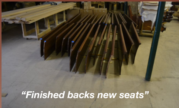
"Finished backs new seats"

With a strong background in modifying old historic pews built for smaller bodies of the early 1900's, The Keck Group used their former experience to create a more comfortable seating as requested by church goers in the 2000's.